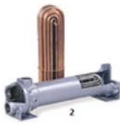
Shell Tube Heat Exchanger