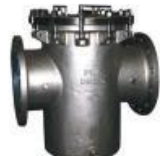
Basket Flanged Strainers