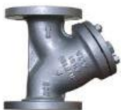
Socket Weld Strainers