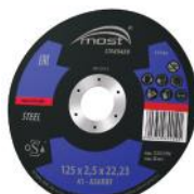
Grinding & Cutting Wheels