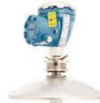
Radar Gauging Products & Solutions