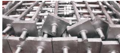
All Type of Bolt & Nuts