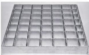
Fabricated Panel, Standard Panel, Handrailing, Heavy Duty Grating