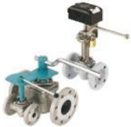
Valve Locking Devices