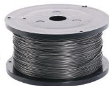
Flux Cored MIG Wire