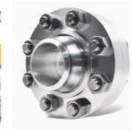
Flanges & Connectors