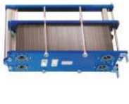
Plate Heat Exchanger