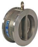
Check Wafer Dual Plate Valve