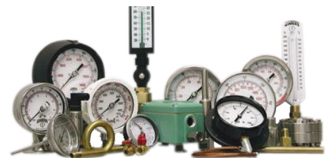
Gauges & Transmitters