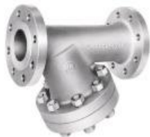
Y Flanged Strainers