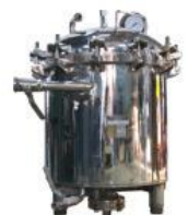
Pressure Plate Filter