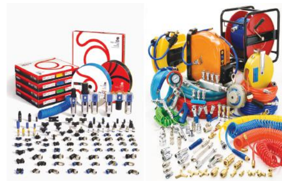
Pneumatics & Hydraulics Fittings PU Tubes and Push Fittings