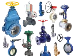
Ball/Gate/Globe/Check/ Butterfly Valves