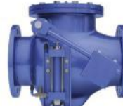
Swing Check Valve