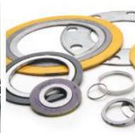
Gaskets (Metallic & Non Metallic)